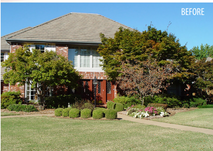
Before and After in South Tulsa

The combination of detailed drawings and specifications provide our clients with a package of information that is more comprehensive than any other firm in the Tulsa Market. As a result, the scope of work for your project is clearly defined before the job starts.