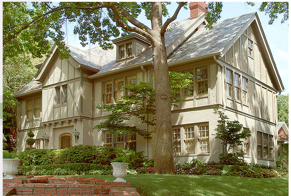
Historic home in Maple Ridge

We staff our jobs with an onsite project Project Manager who coordinates and optimizes all activities through the use of the Builder Trend construction management system. Cloud-based, it is an efficient way for clients to communicate with the team, archive documents and measure progress. To find out more about the Builder Trend program, visit an introductory video on Builder Trend on our website .